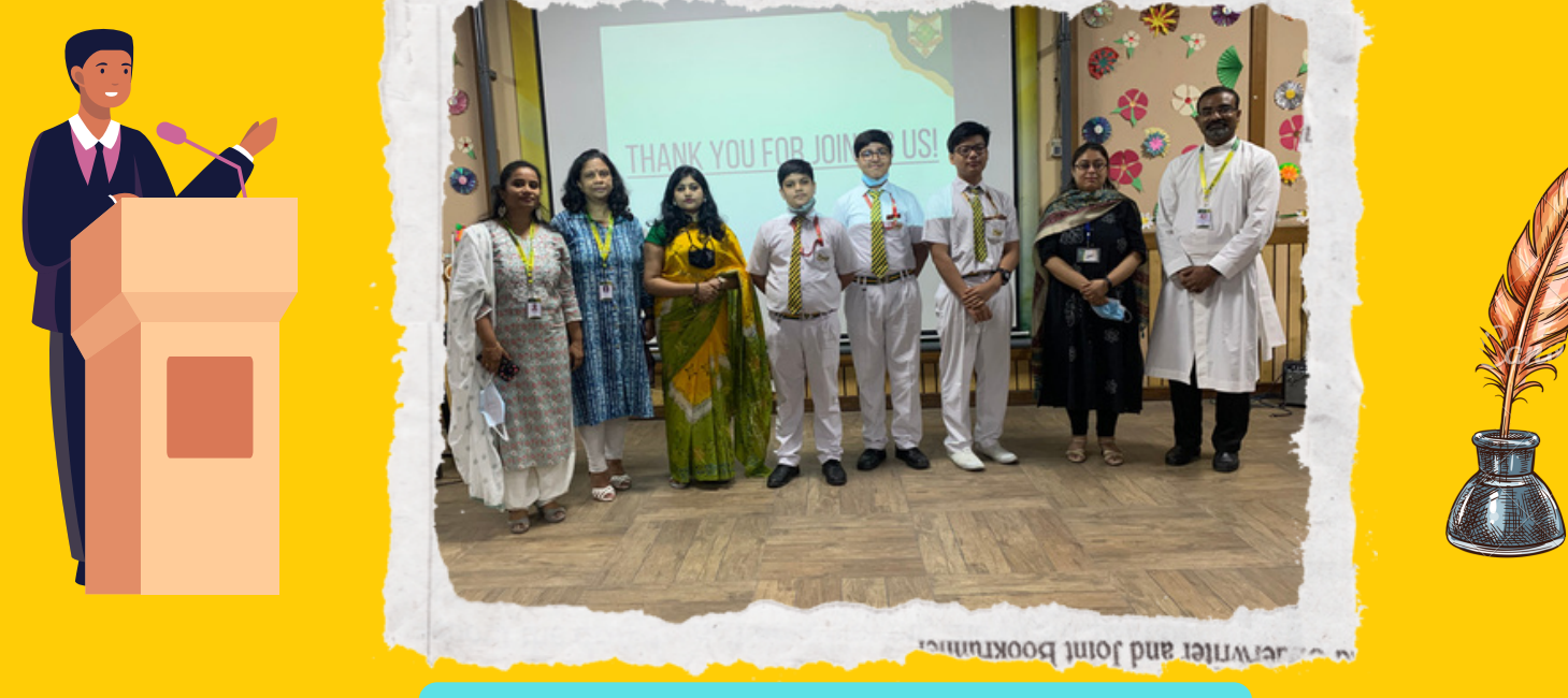
"Poetry comes alive through recitation".

Class 9 inter-class Ballad and Poetry recitation was held on the 28th of August in the MSA. The students recited timeless ballads from the Victorian period to the contemporary. The recitation proved to be a perfect opportunity for the young students to exhibit their talent and confidence. The event inspired class 9 students to come forward and recite poems with proper diction, intonation, enunciation and rhythm on stage.